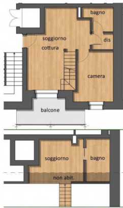
PLANIMETRIA INDICATIVA APPARTAMENTO C9

Il presente stampato ha valore puramente indicativo e non costituisce elemento contrattuale nè presupposto contrattuale.