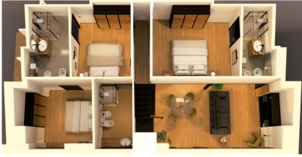
Render vista piano sup