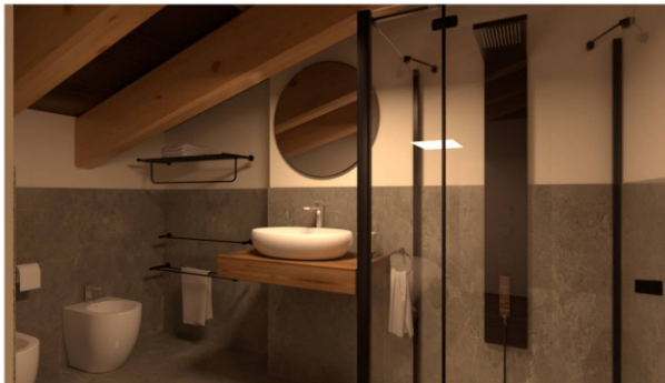
Render bagno 2