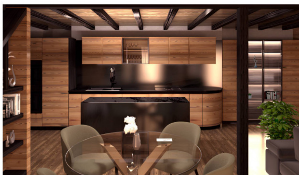
Render living / cucina