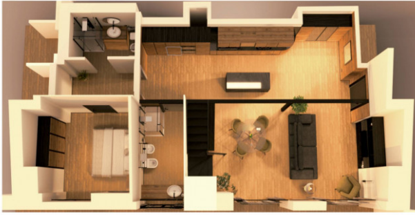
Render vista piano inf.