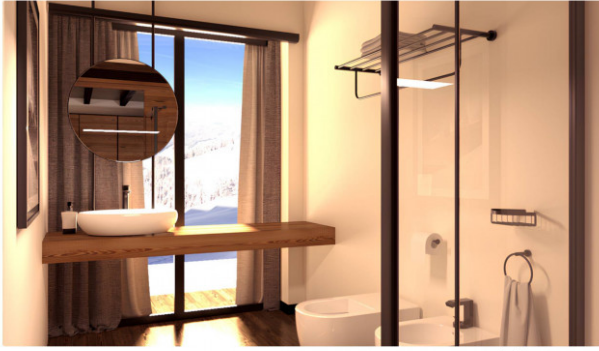
Render bagno 1