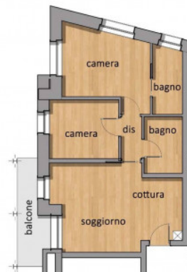
PLANIMETRIA INDICATIVA APPARTAMENTO B7

Il presente stampato ha valore puramente indicativo e non costituisce elemento contrattuale nè presupposto contrattuale.