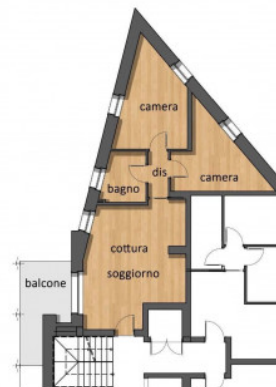
PLANIMETRIA INDICATIVA APPARTAMENTO A9

Il presente stampato ha valore puramente indicativo e non costituisce elemento contrattuale nè presupposto contrattuale.