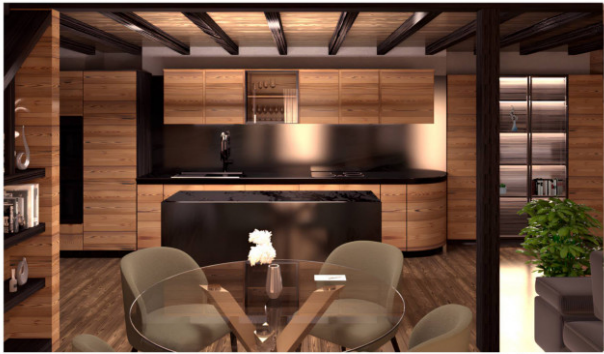
Render living / cucina