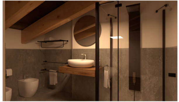
Render bagno 2