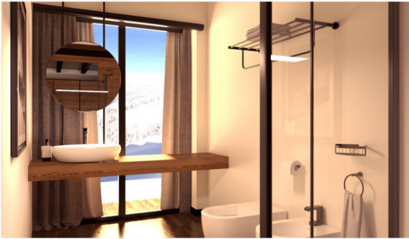
Render bagno 1