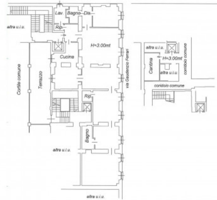
PIANO PRIMO PIANO INTERRATO PLANIMETRIA INDICATIVA